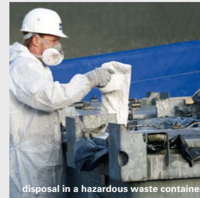
disposal in a hazardous waste container