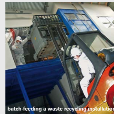
batch-feeding a waste recycling installation